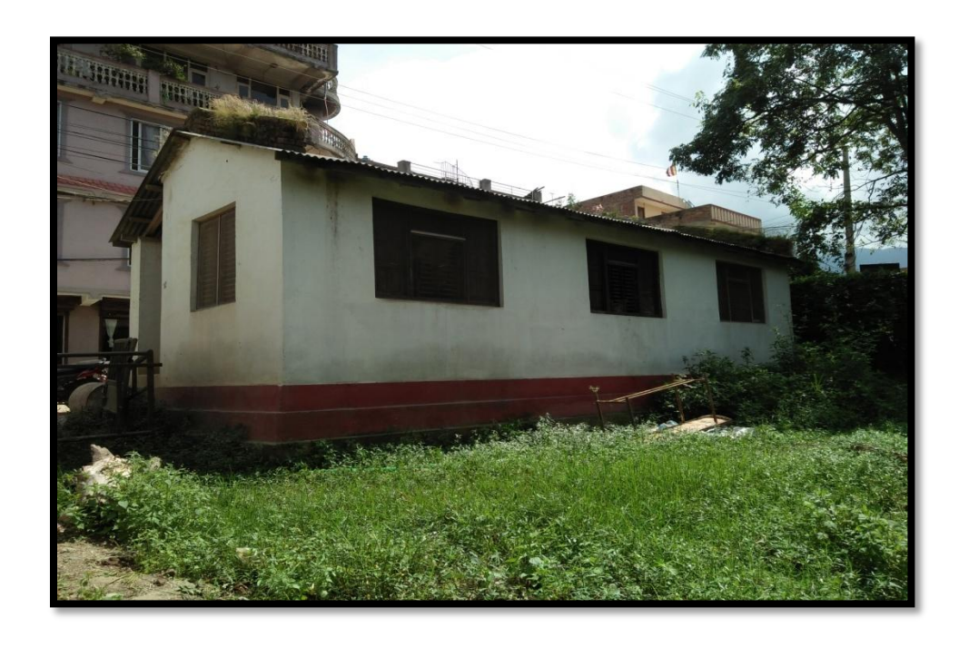
Existing Office Building to be Demolished