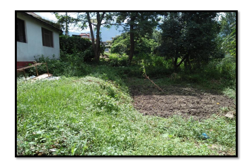
Annex VI: Photographs (Proposed Site)