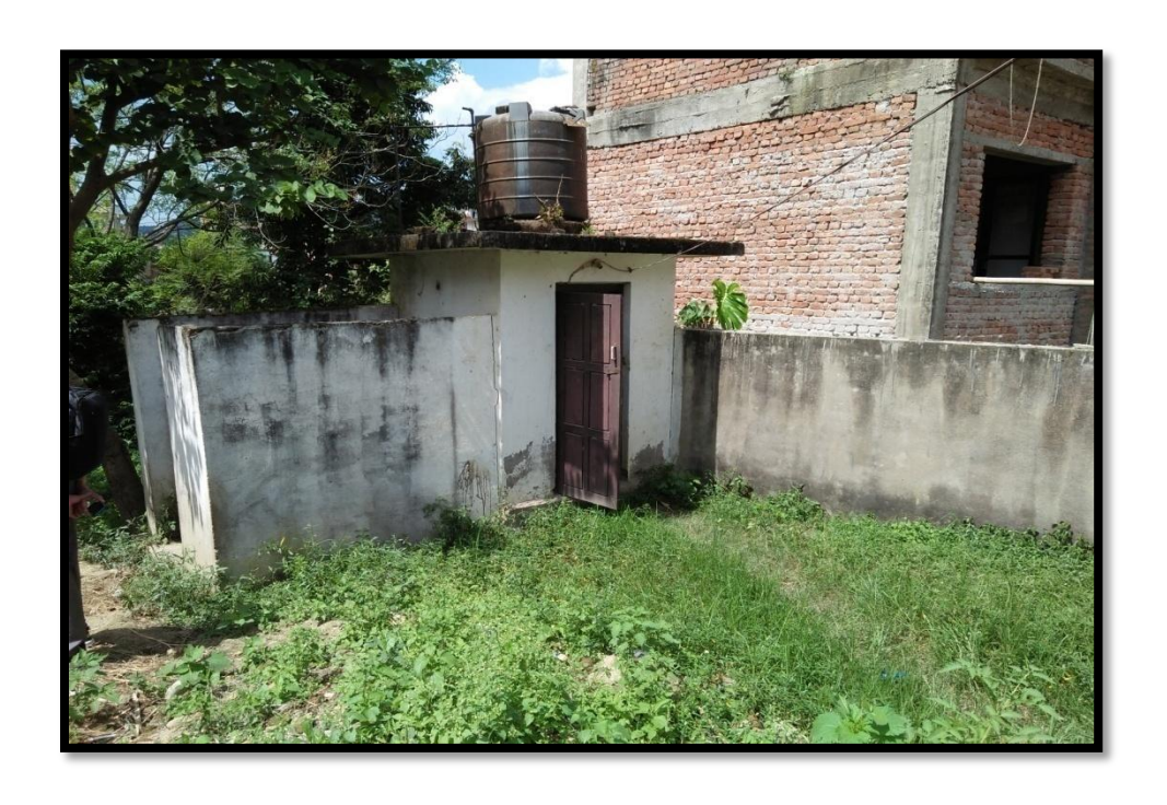
Existing Toilet to be Demolished